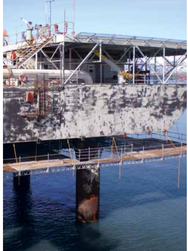
Photo: QuikDeck® in use for maintenance and repair of an offshore platform in Alaska.