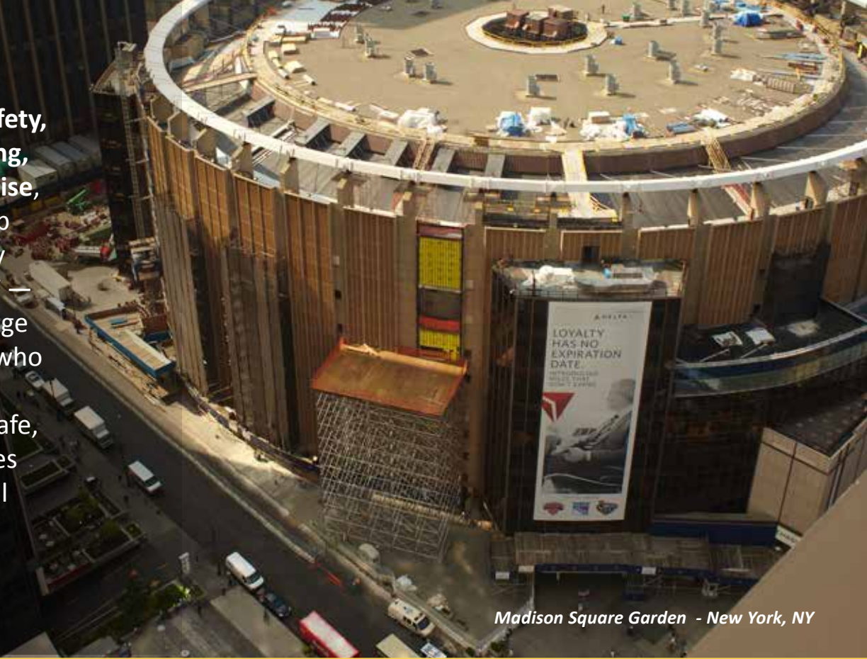
Madison Square Garden - New York, NY

Through SMART Safety, Innovation, Planning, Process and Expertise , our people come up with ideas everyday — THE SMART WAY — by sharing knowledge and resources. It's who we are. It's how we work. The result? Safe, productive worksites and the lowest total installed cost.