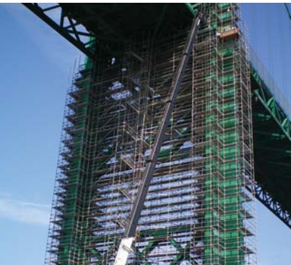
This page (clockwise): Alexandra Bridge (Ontario, & Quebec, Canada); Lewis & Clark Bridge (Rainier, OR & Longview, WA); Vincent Thomas Bridge (Long Beach, CA).